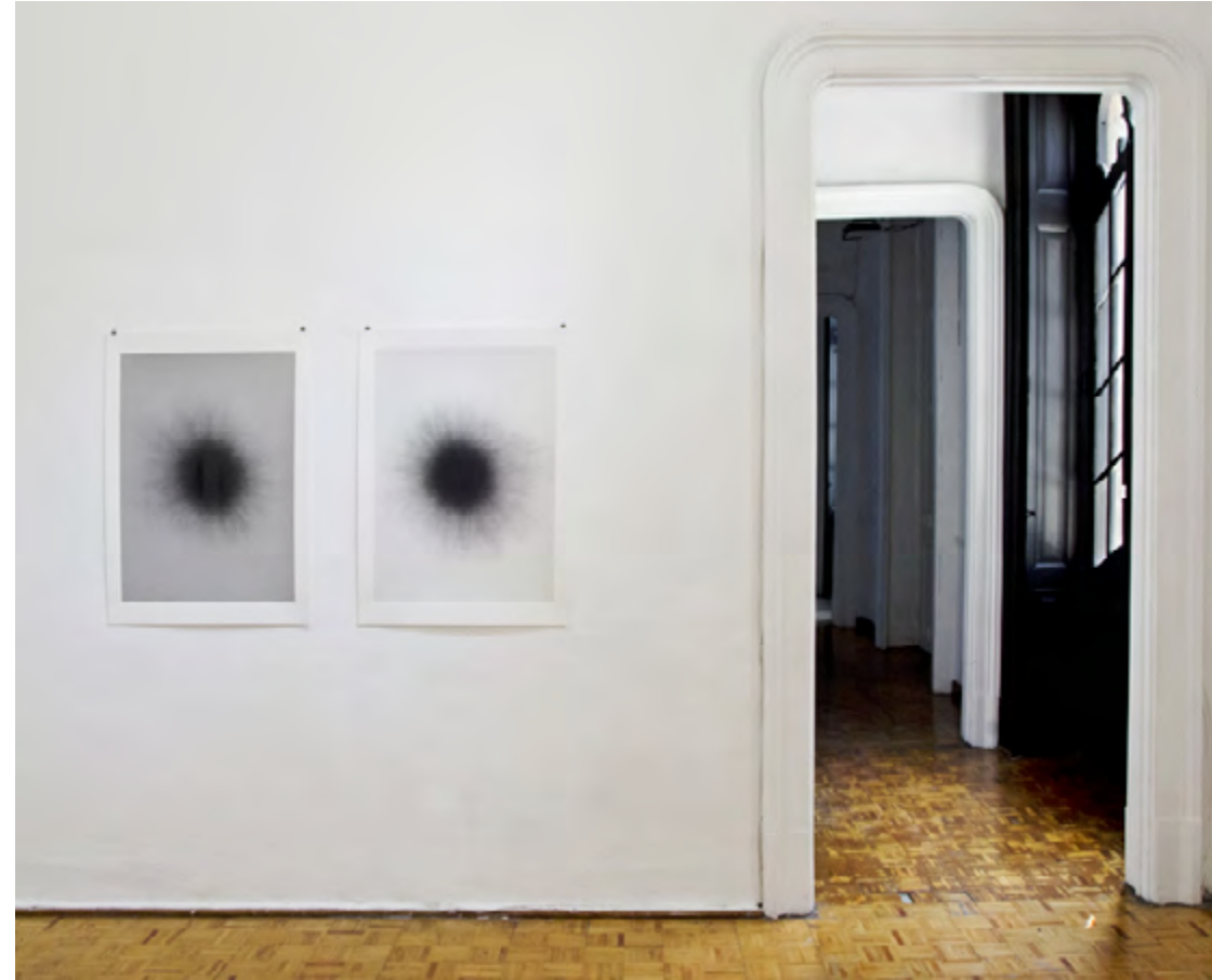
Gray and white, 2007 Silkscreen prints (unique pieces) on paper 28" x 39" e/o