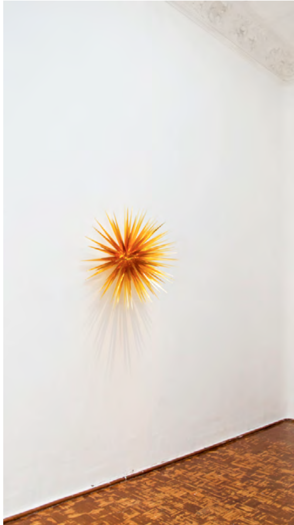
Amber Star No. 2 , 2010 Cast Glass and aluminum, 32" x 18.5"