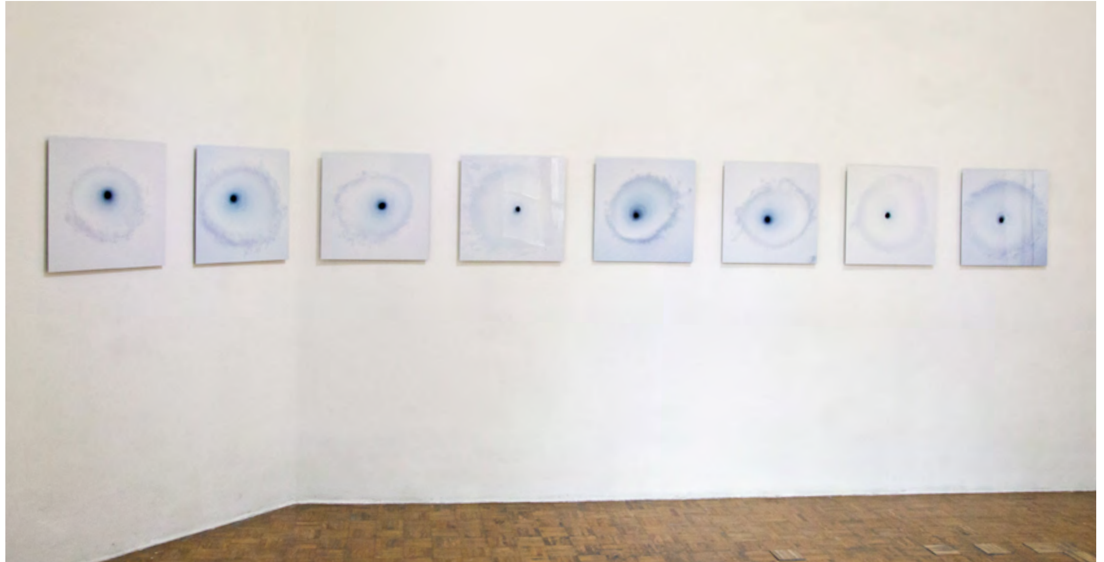
Hawk pond I-VIII , 2014 Metal transfer prints on aluminum. 2014, 20" x 20" e/o