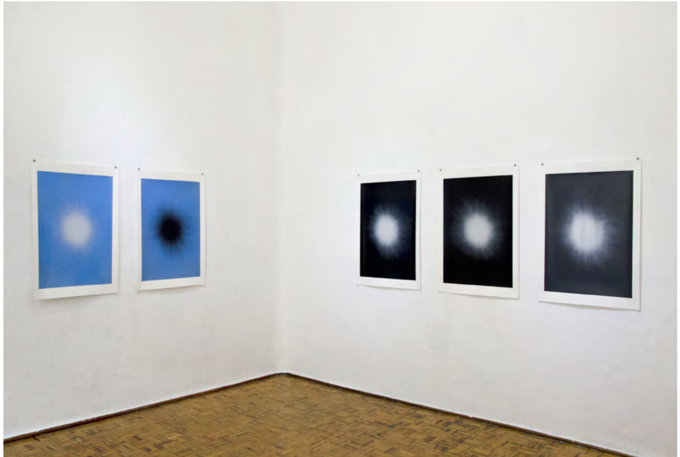
Blue and black , 2007 Silkscreen prints (unique pieces) on paper 28" x 39" e/o