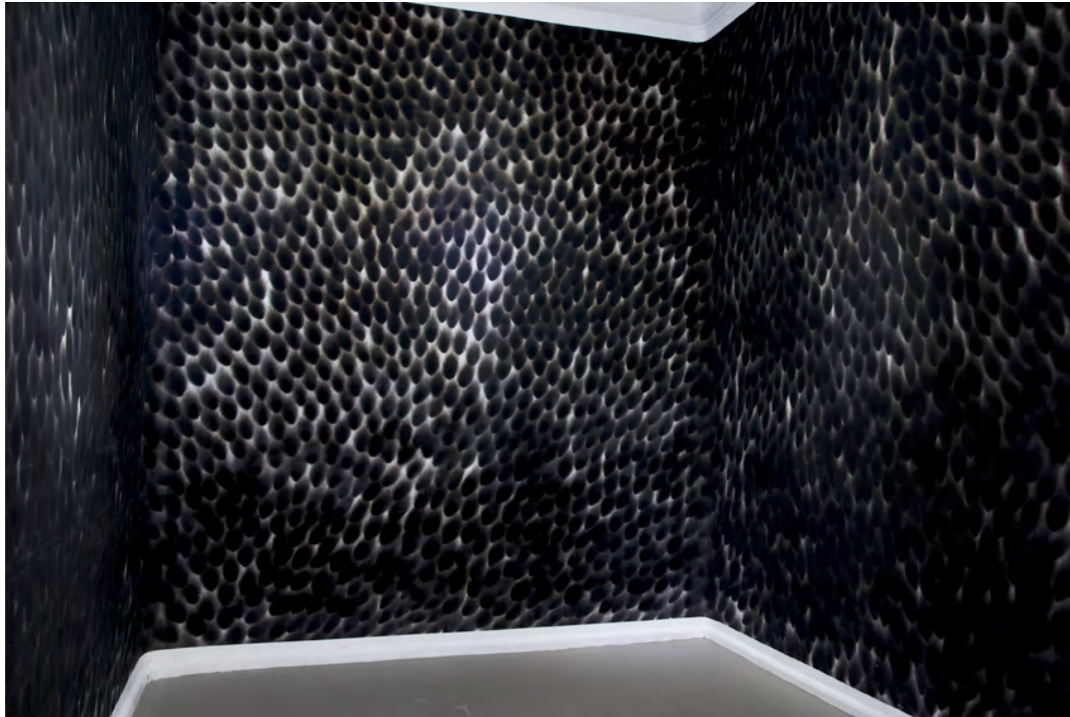
Carbon Wall Drawing No.4, 2014 Carbon and fixative Variable Dimensions