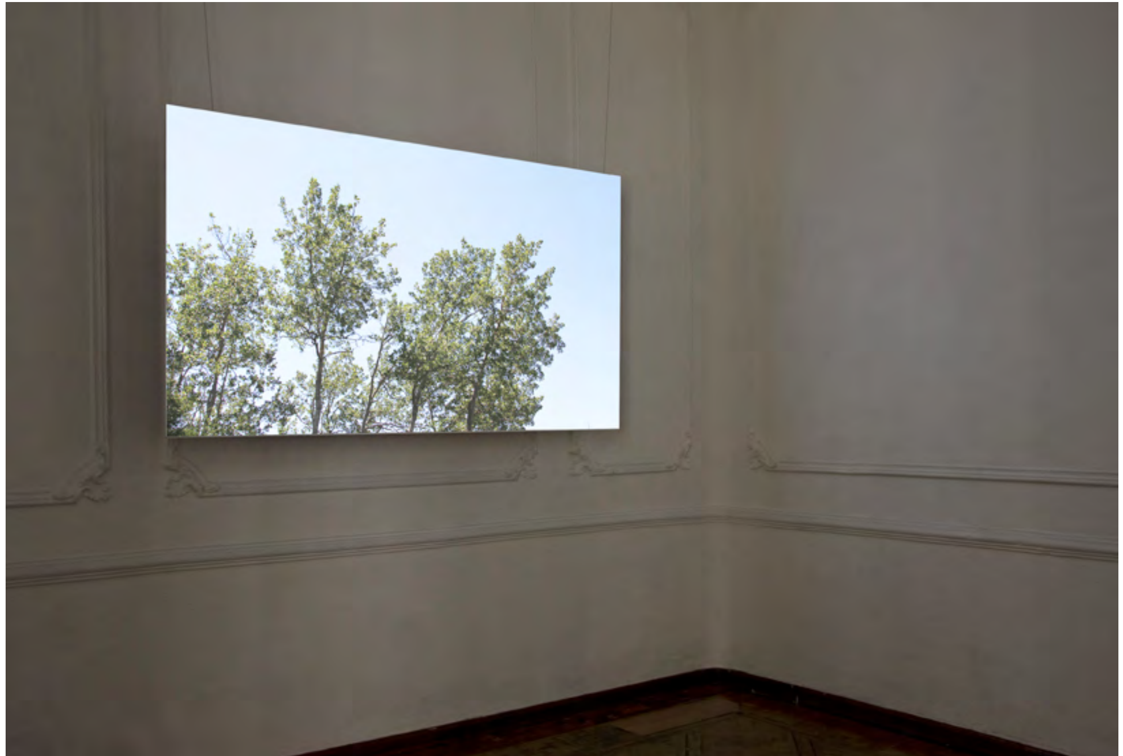
Deep cove , 2014 Video Hd, 16:9, 4:00 min, loop.