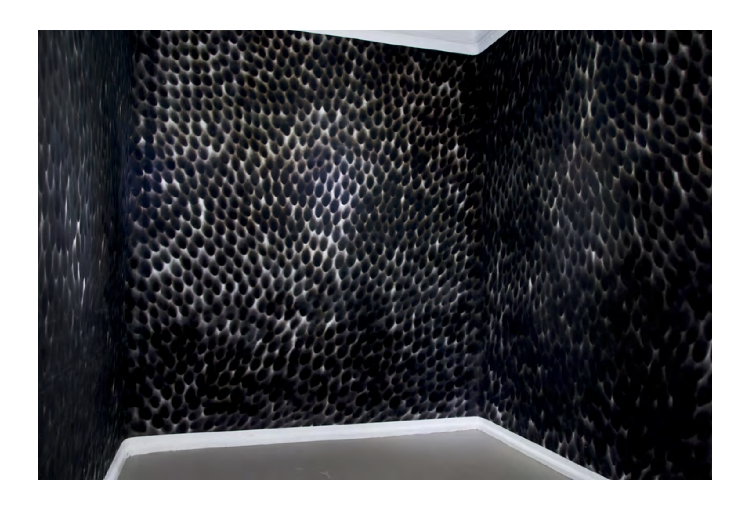
Carbon Wall Drawing No.4, 2014 Carbon and fixative Variable Dimensions