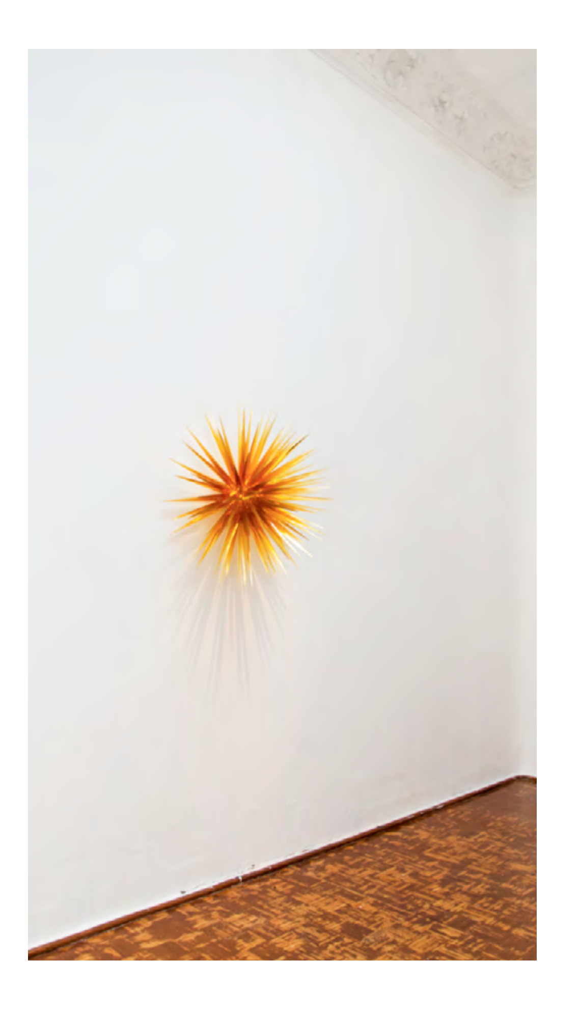
Amber Star No. 2, 2010 Cast Glass and aluminum, 32" x 18.5"