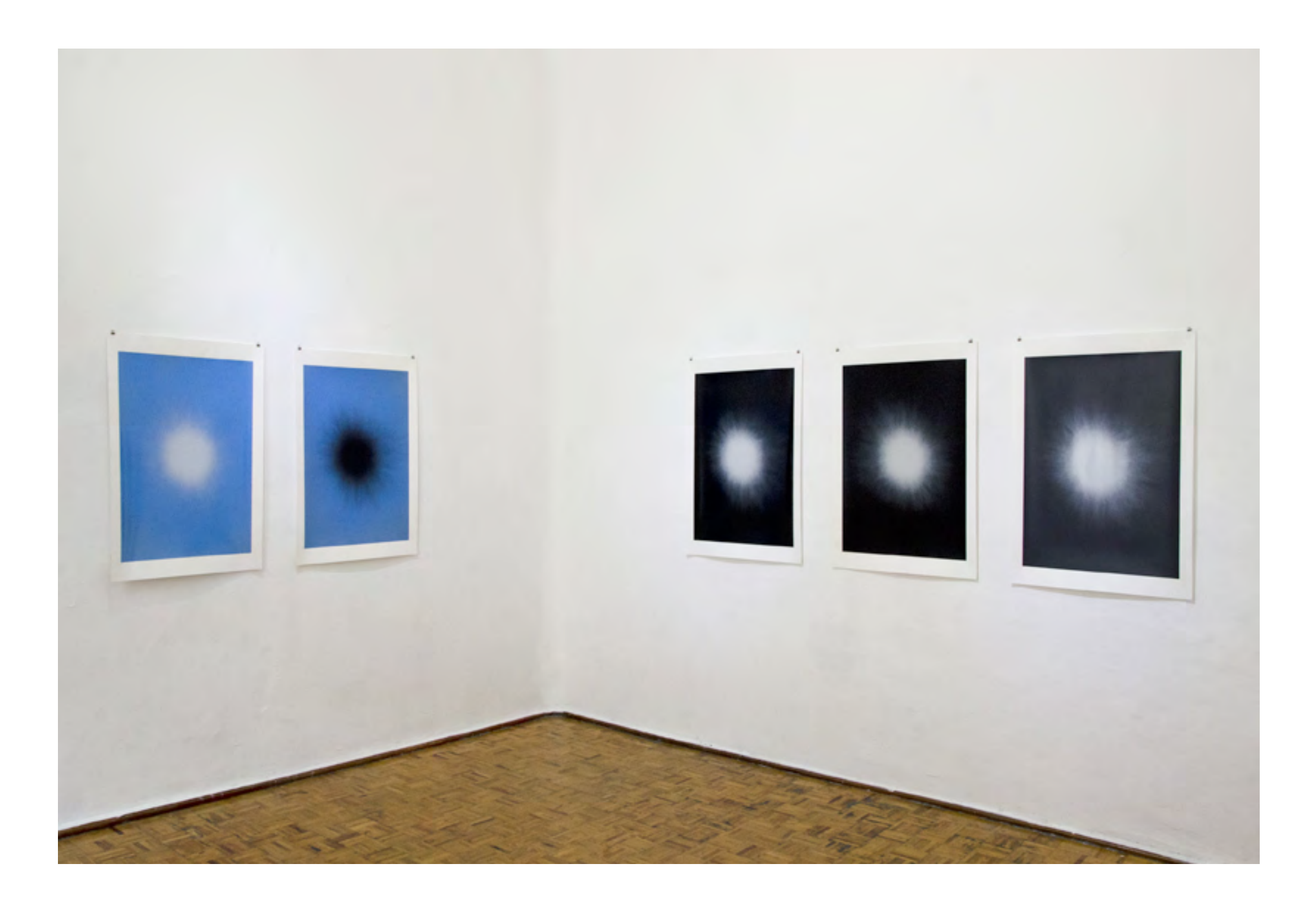
Blue and black, 2007 Silkscreen prints (unique pieces) on paper 28" x 39" e/o